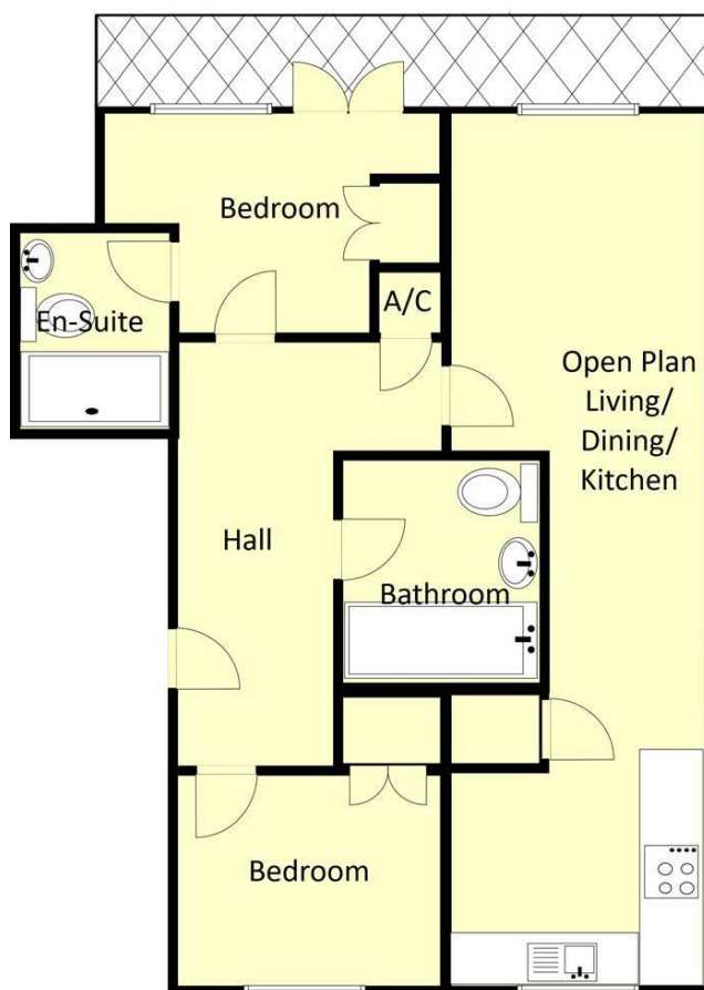
Hawthorne Gardens For illustrative purposes only, NOT to scale.